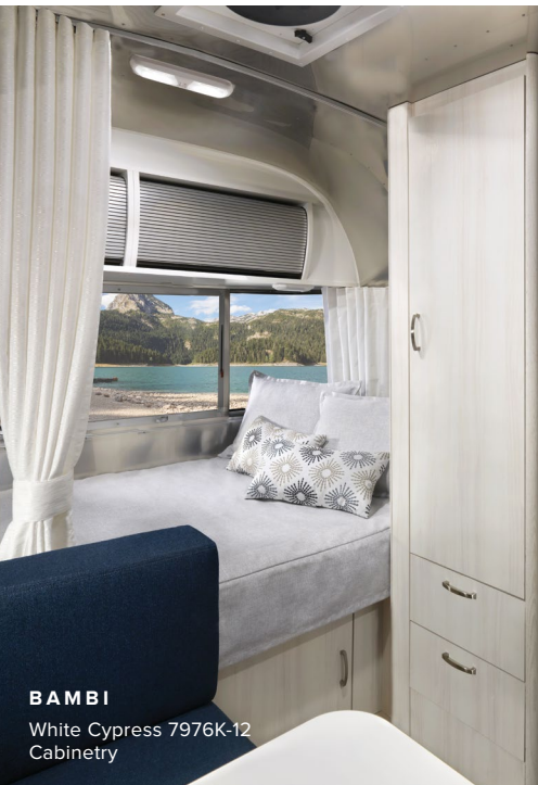
BAMBI White Cypress 7976K-12 Cabinetry