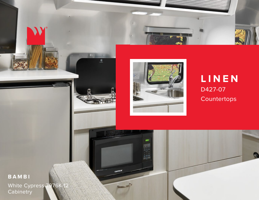
BAMBI White Cypress 7976K-12 Cabinetry