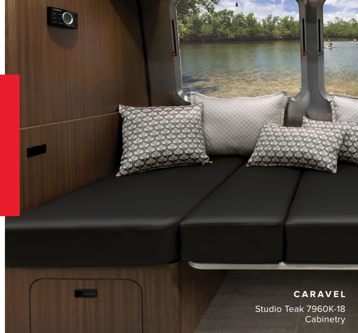
CARAVEL Studio Teak 7960K-18 Cabinetry