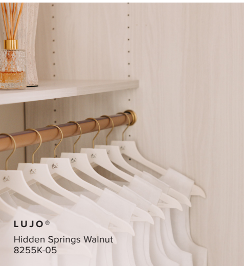
LUJO® Hidden Springs Walnut 8255K-05

The word “bespoke” is defined as “made for a particular customer or user.”