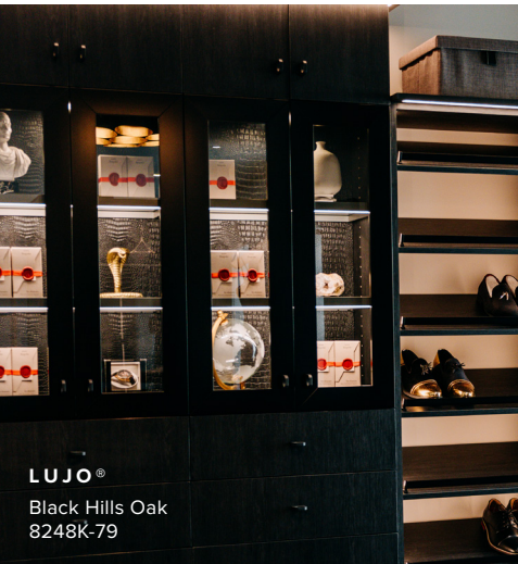
LUJO® Black Hills Oak 8248K-79

So when the team set out to build their flagship design studio, every detail was considered and every surface was carefully selected. The studio is affectionately called “Casa di Burke” as a nod to the European design influences that shape the space. Throughout the 1800 sq. ft. area, clients can explore products, finishes, and surfaces that will deliver their vision for organized luxury.